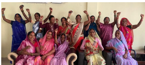
Elected Leaders Forum from Yasodhara Rural Municipality, Kapilvastu