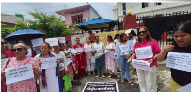
Women for Women: Against the polygamy draft