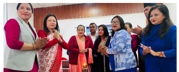
National Day for the Elimination of Racial Discrimination and Untouchability