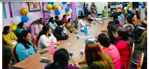
31 Years of Resilience and Advocacy