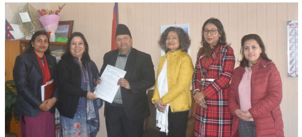
FEDO's Letter to National Planning Commission