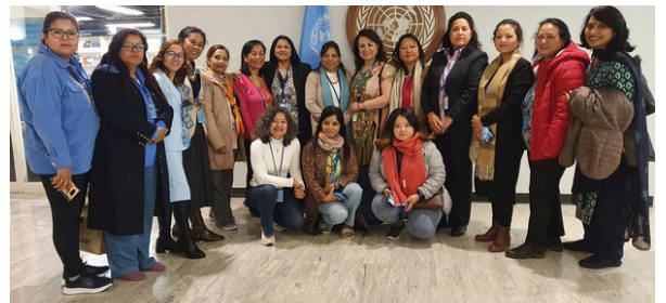
Commission on the Status of Women CSW68