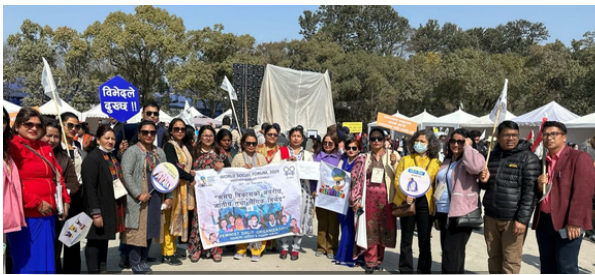
World Social Forum WSF2024