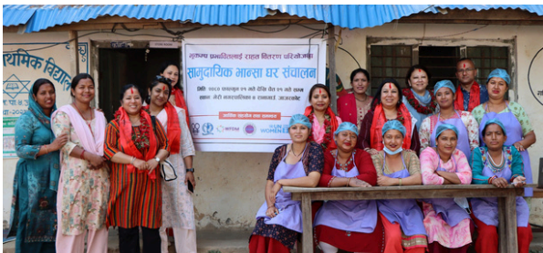
Community Kitchen Launched